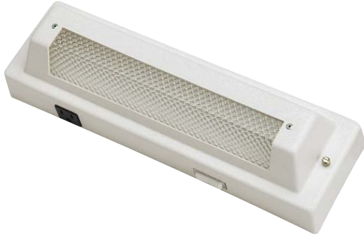
Half cut-out lens shown