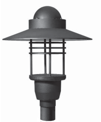
(Shown with Standard Triple Rings and shade; mounted on 4" diameter pole)